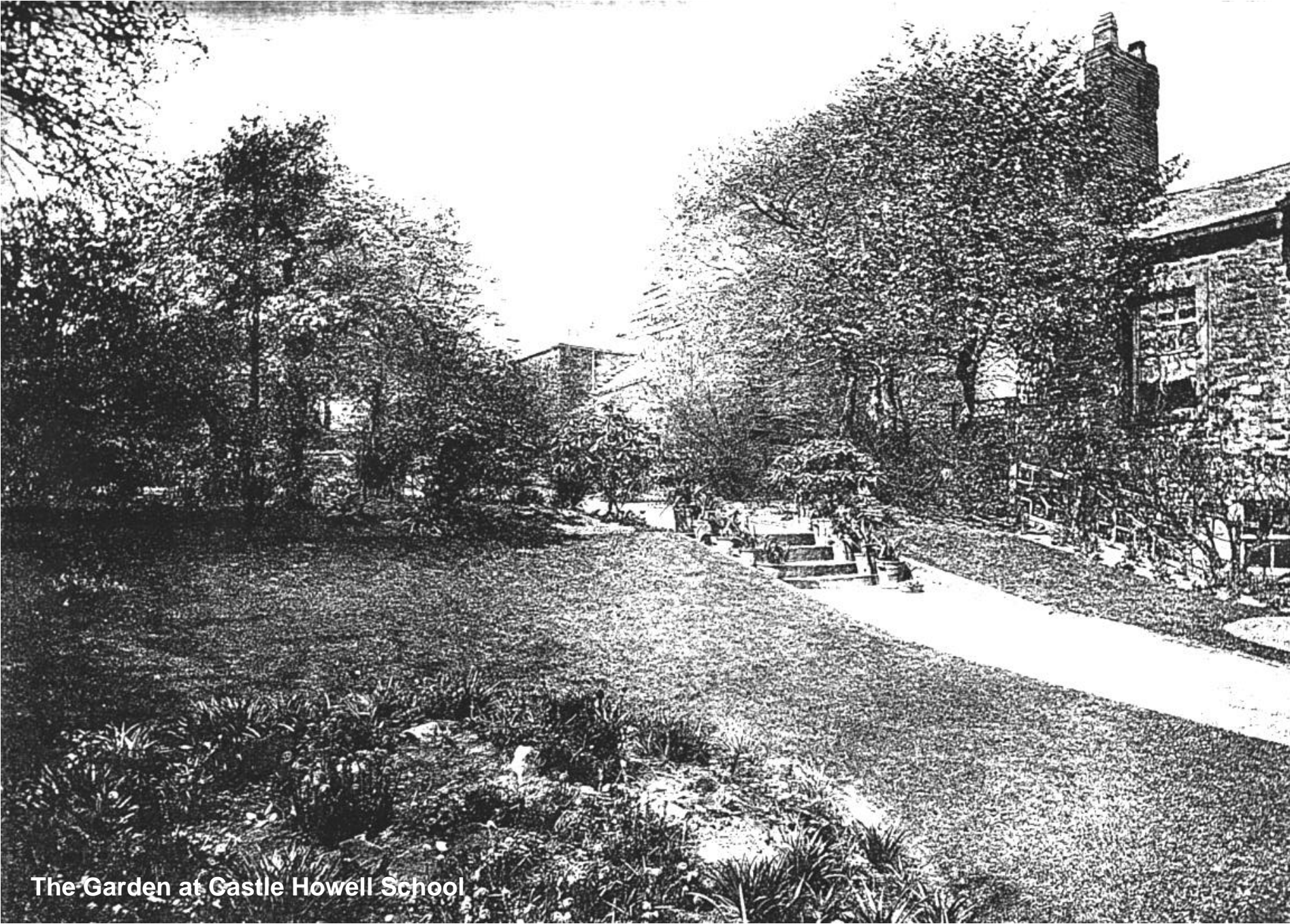
The Garden at Castle Howell School