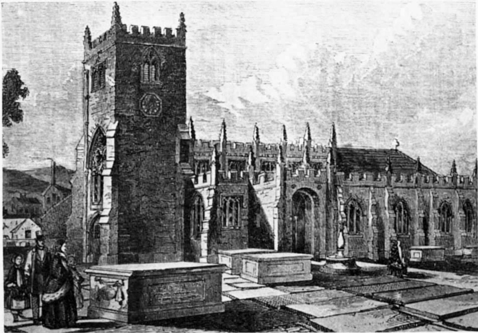
ROCHDALE PARISH CHURCH EARLY IN 19th CENTURY.