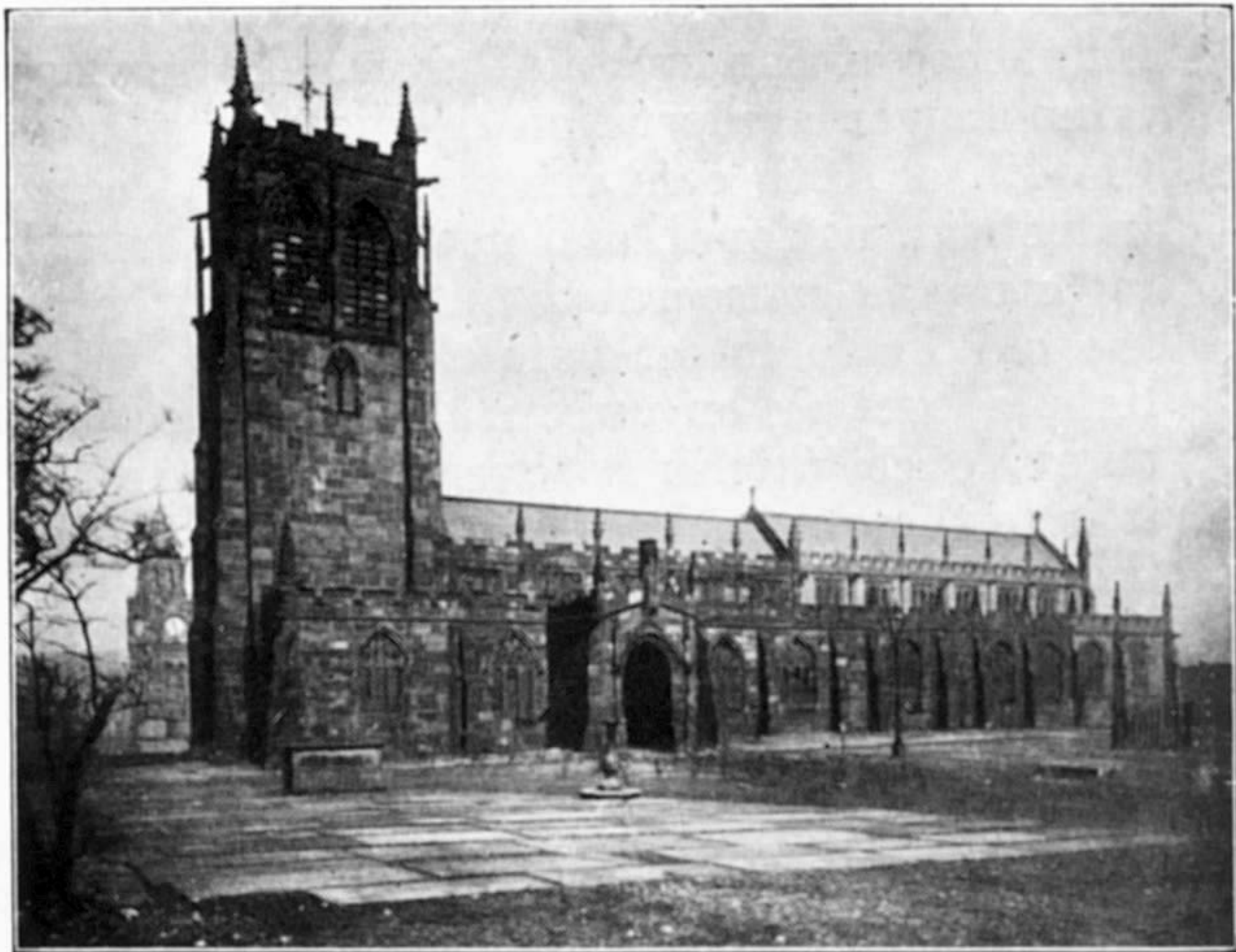
ROCHDALE PARISH CHURCH AND CHURCHYARD, 1892.