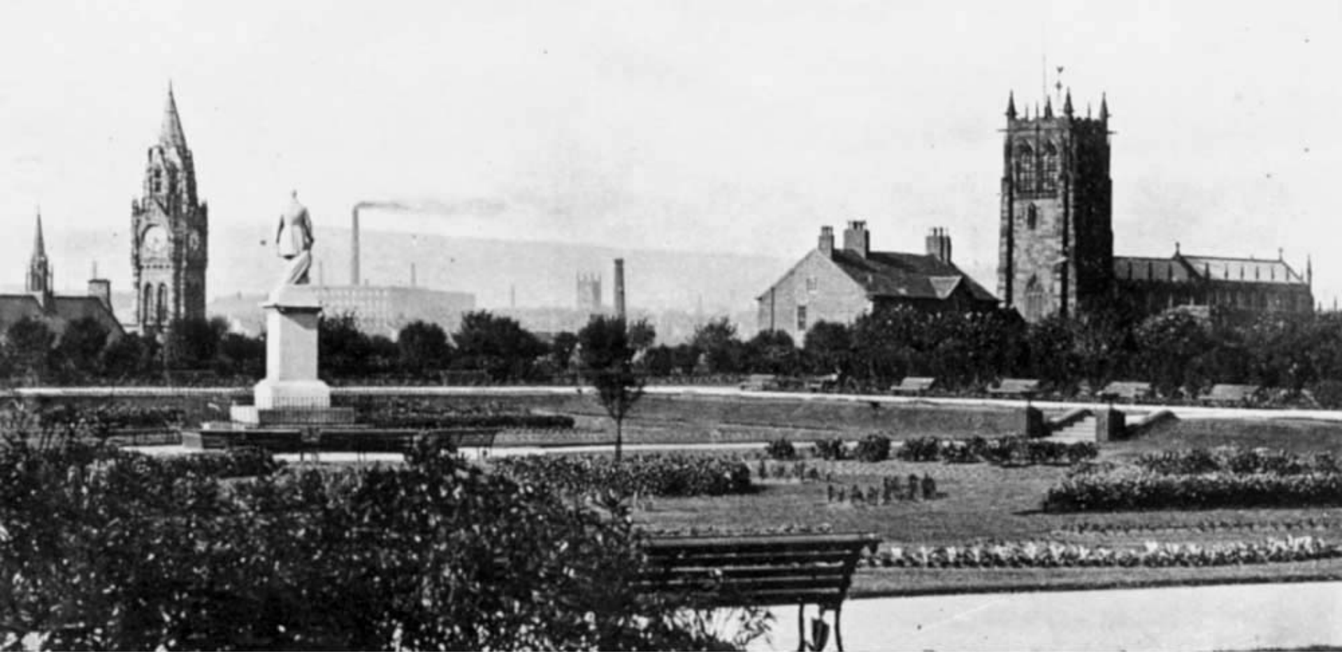
View of Park