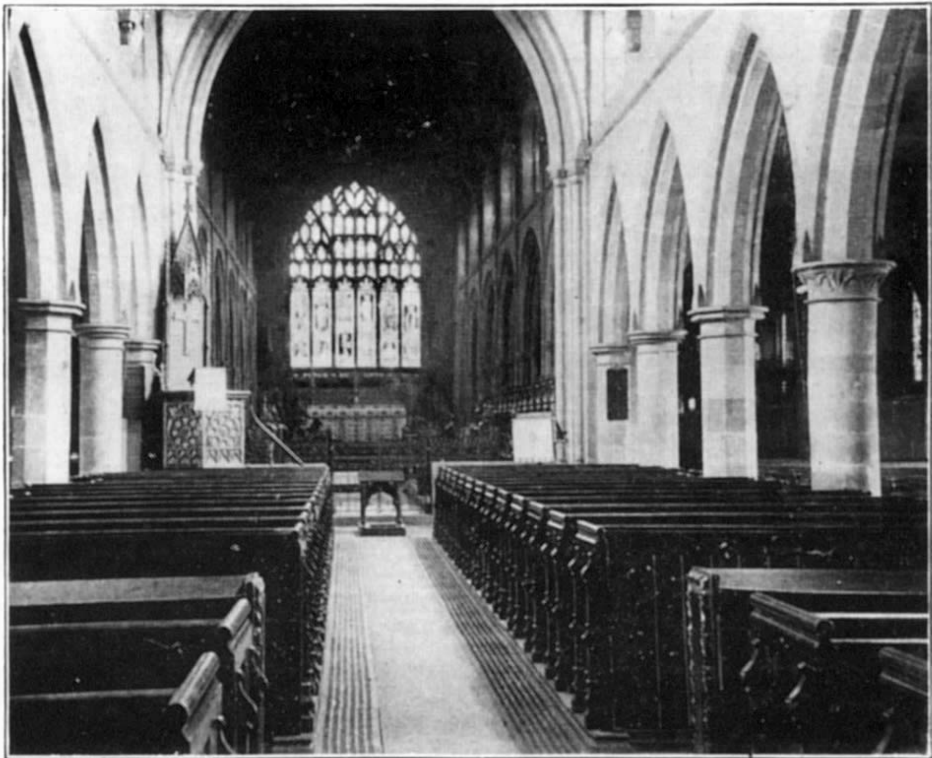
ROCHDALE PARISH CHURCH INTERIOR IN 1904.

(from a plate kindly lent by the Manchester Geographical Society).