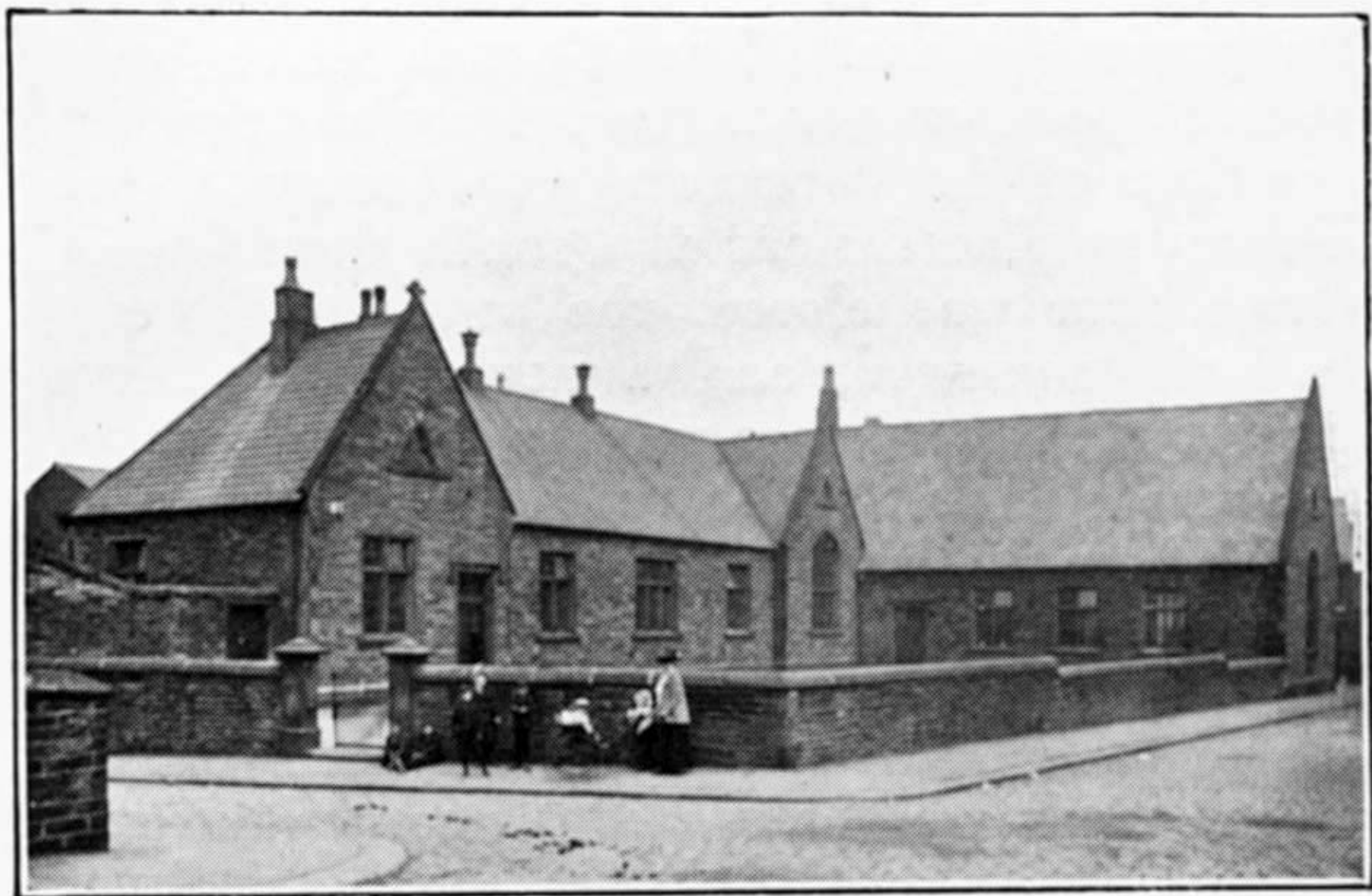
ANN STREET GIRLS' SCHOOL, 1858.

Now the Parish Church Infant Day and Sunday School.