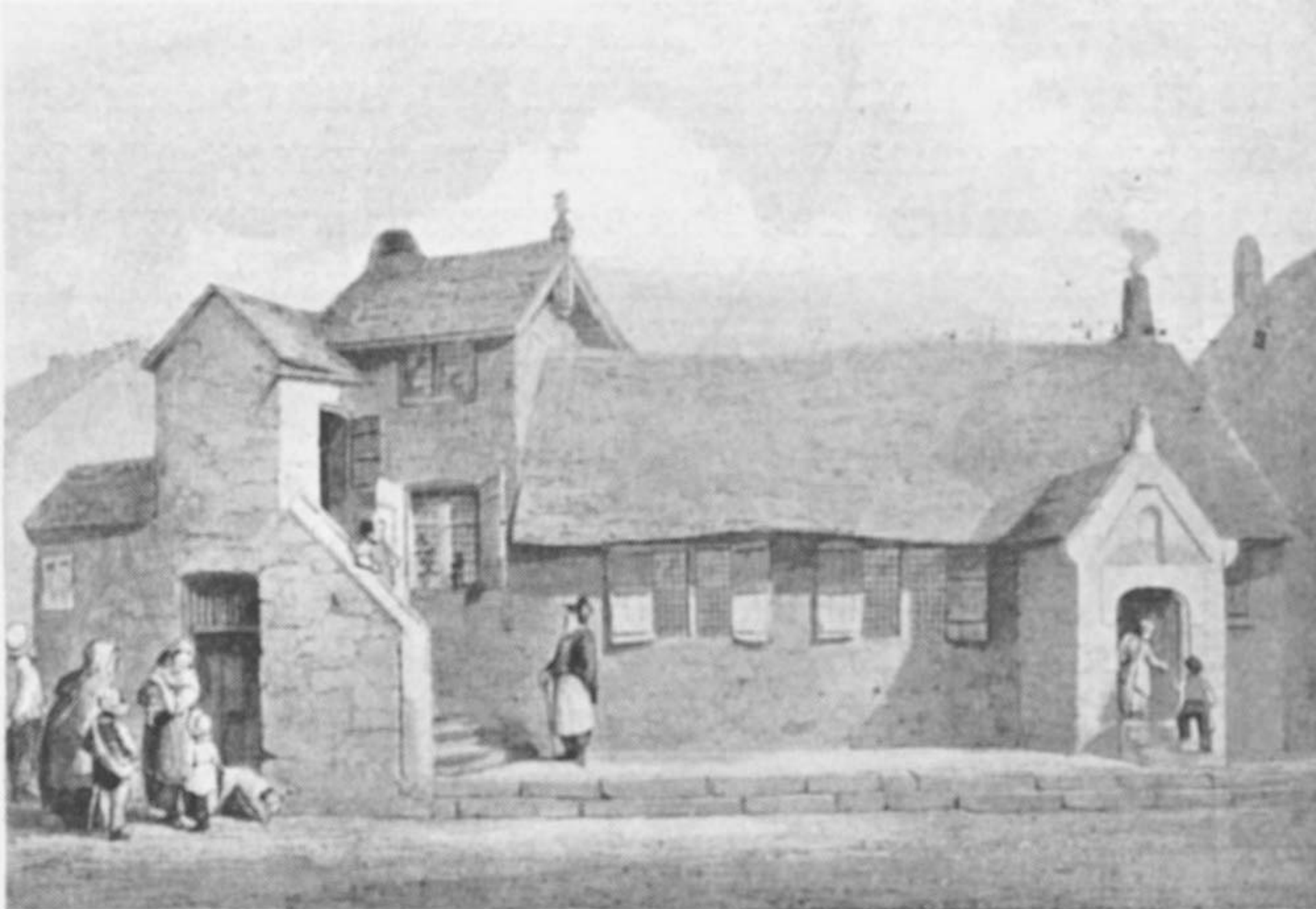
The Old Grammar School